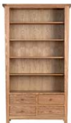
ASH-TBK-01 ASHVILLE TALL BOOKCASE H 1942 x W 1102 x D 450